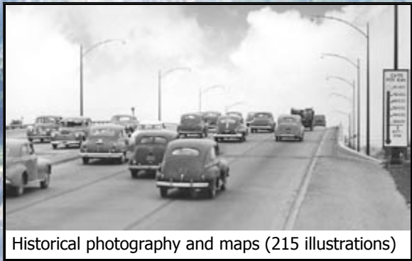
Historical photography and maps (215 illustrations)