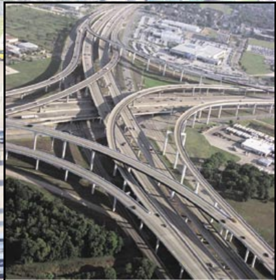
Modern aerial and ground photography (143 illustrations)