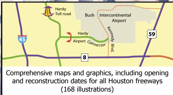
Comprehensive maps and graphics, including opening and reconstruction dates for all Houston freeways (168 illustrations)

Perhaps no city has been as heavily influenced by the freeway as Houston—not even Los Angeles. Houston’s widespread use of freeway frontage roads has created a distinctive style of freeway that has been extraordinarily powerful in shaping the city.